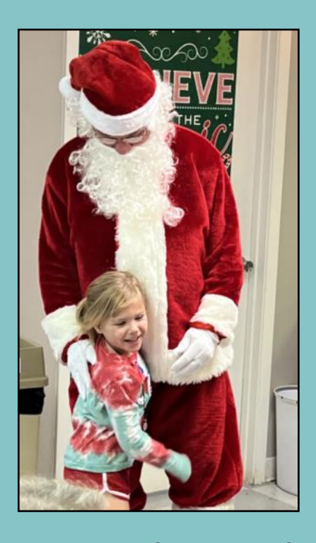
Santa made a special appearance at the Christmas Community Party on December 10!